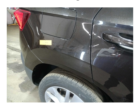
2. REAR: Trunk - visual damage

1. SIDE: Left and right side - visual damage / scratches