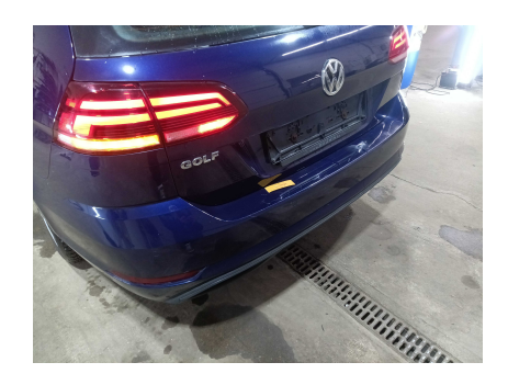
3. REAR: Trunk - visual damage