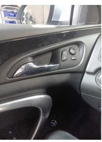
2. INSIDE: Carpets - condition