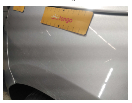
1. SIDE: Left and right side - visual damage / scratches