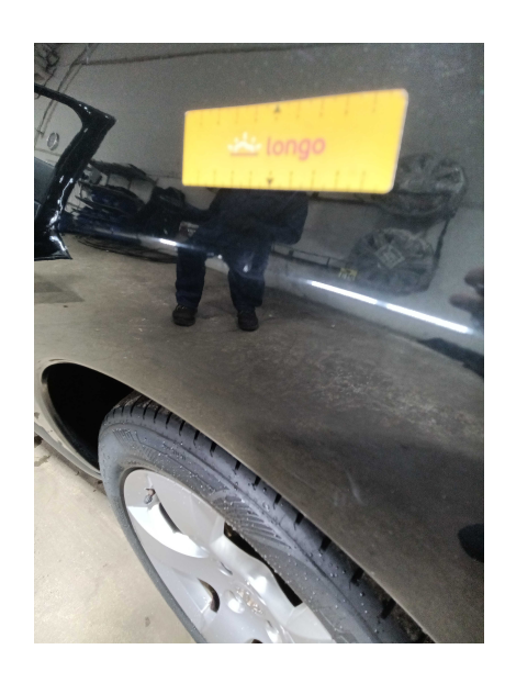
5. SIDE: Left and right side - visual damage / scratches