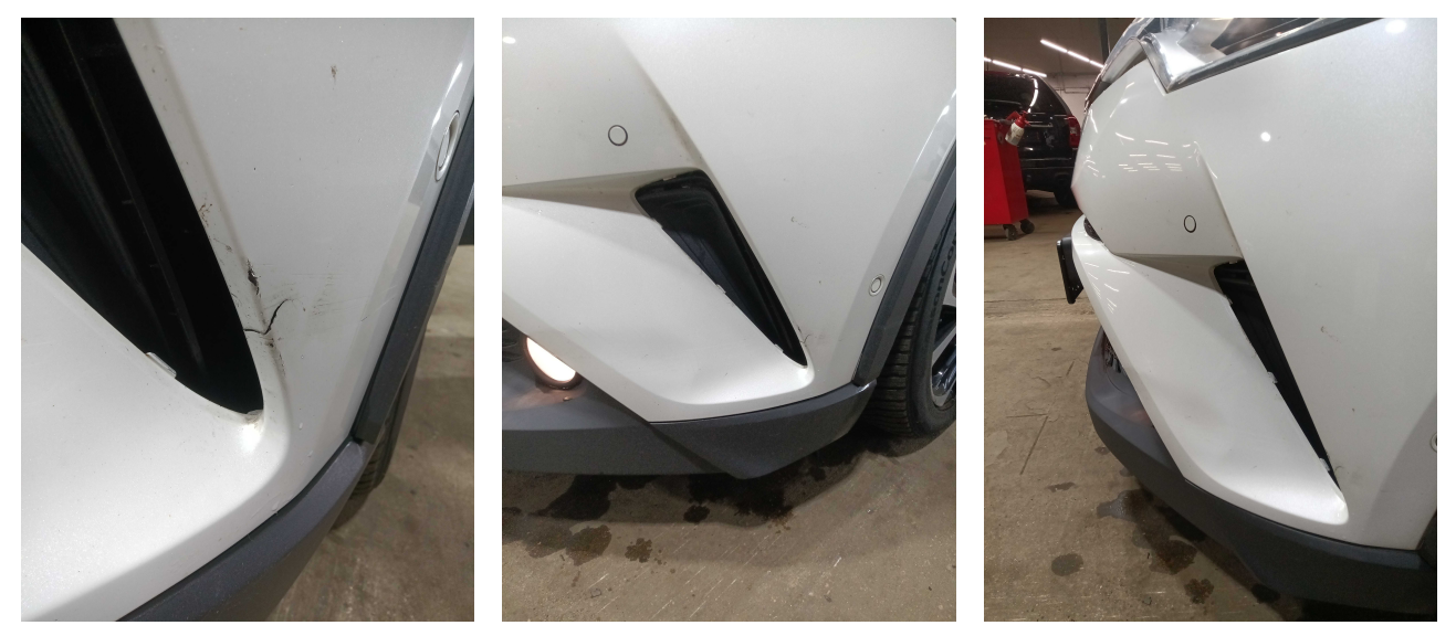
2. FRONT: Front grill - condition

1. FRONT: Front bumper - condition and alignment