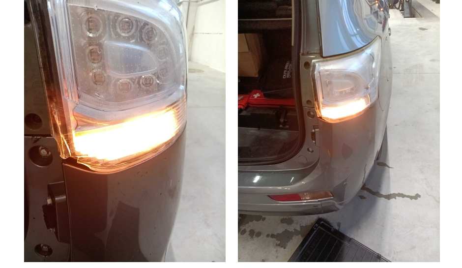
2. REAR: Rear bumper - condition and alignment