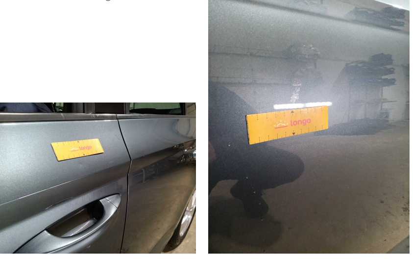
1. SIDE: Left and right side - visual dama