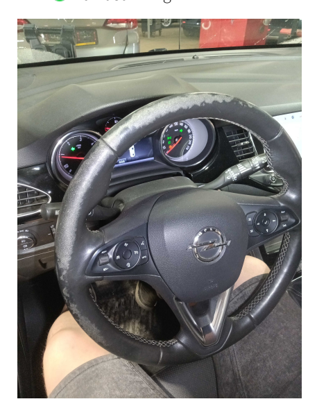
2. INSIDE: Carpets - condition