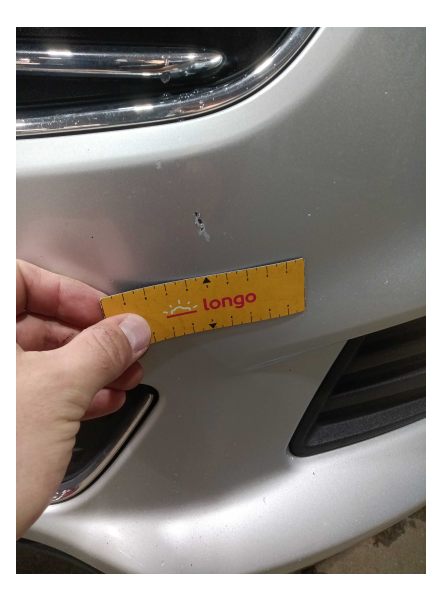
2. FRONT: Hood - visual damage