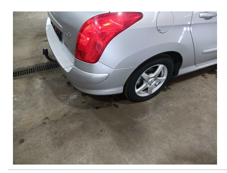
2. REAR: Trunk - visual damage