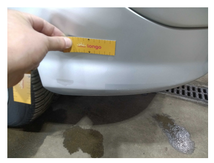
1. REAR: Rear bumper - condition and alignment