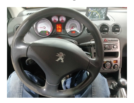
1. FRONT: Steering wheel - condition