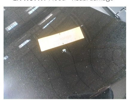
1. FRONT: Hood - visual damage