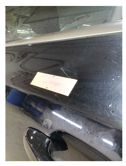
7. SIDE: Left and right side - visual damage / scratches