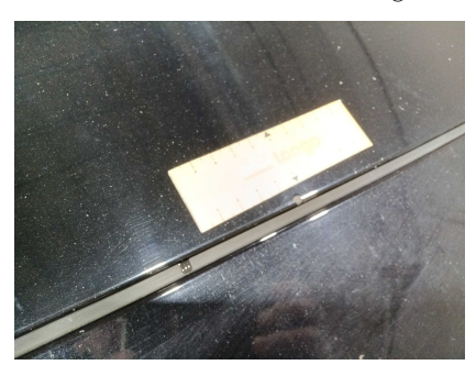
1. FRONT: Hood - visual damage