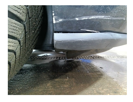
4. REAR: Rear bumper - condition and alignment