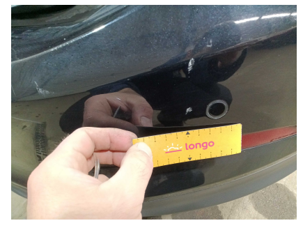
5. REAR: Tow hitch (attachment, removal mechanism, external light connector, thickness of connector)