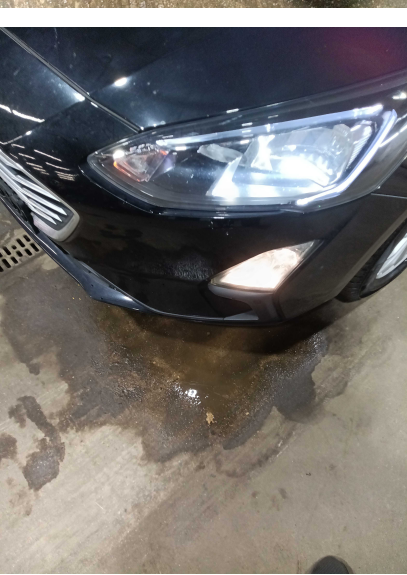
3. FRONT: Front bumper - condition and alignment