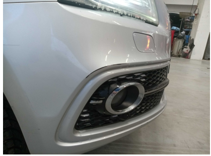
2. SIDE: Left and right side - visual damage / scratches