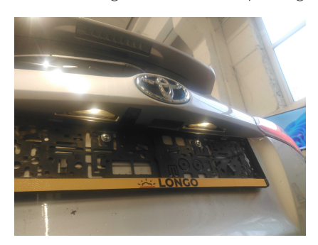
2. OTHER: Additional polishing tasks