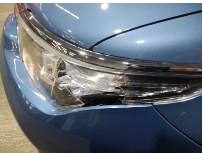
2. LIGHTS: Light Bulbs