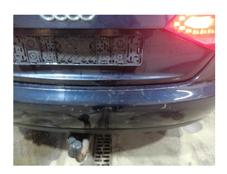
5. REAR: Trunk - visual damage