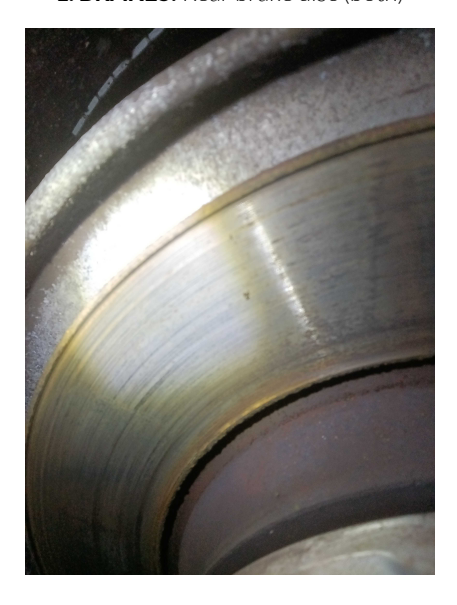
1. BRAKES: Rear brake disc (both)