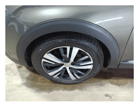
1. SIDE: Wheels - condition