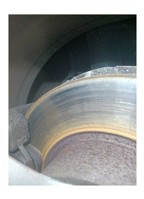
3. BRAKES: Rear brake disc (both)