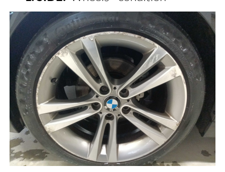
1. SIDE: Wheels - condition