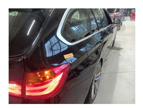
4. REAR: Rear bumper - condition and alignment