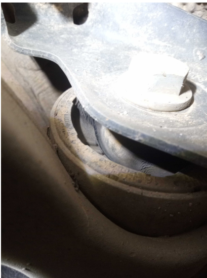
arm, rear - bush