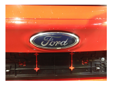
4. FRONT: Front bumper - condition and alignment