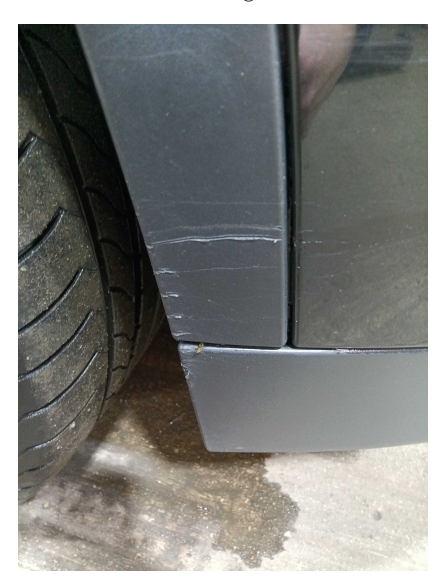
5. REAR: Rear bumper - condition and alignment