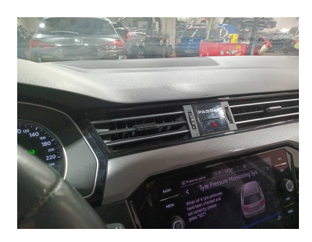
2. INSIDE: Trims - condition