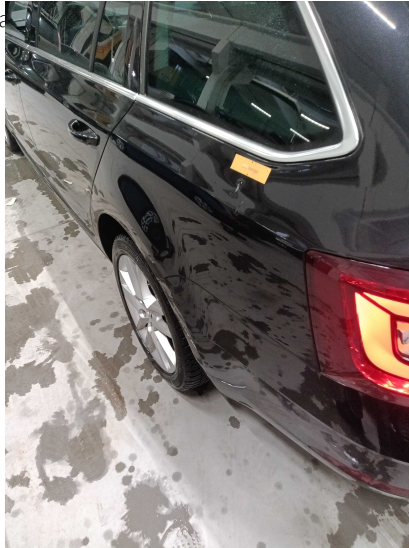
6. SIDE: Left and right side - visual damage / scratches