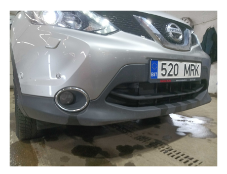
4. SIDE: Wheels - condition