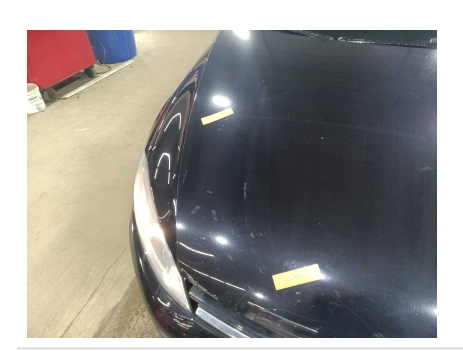
2. FRONT: Front bumper - condition and alignment