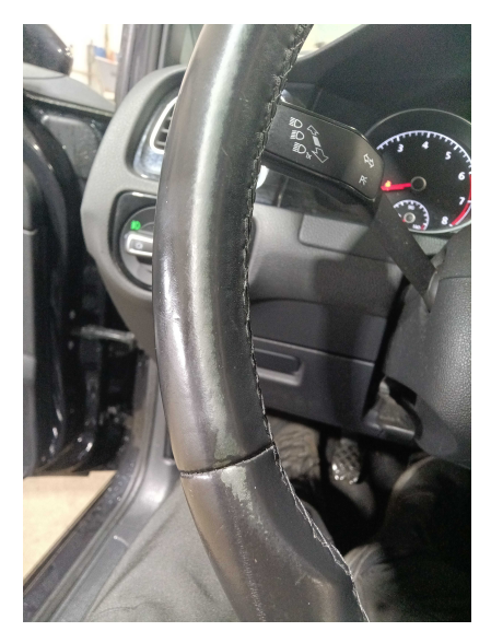
2. INSIDE: Trims - condition