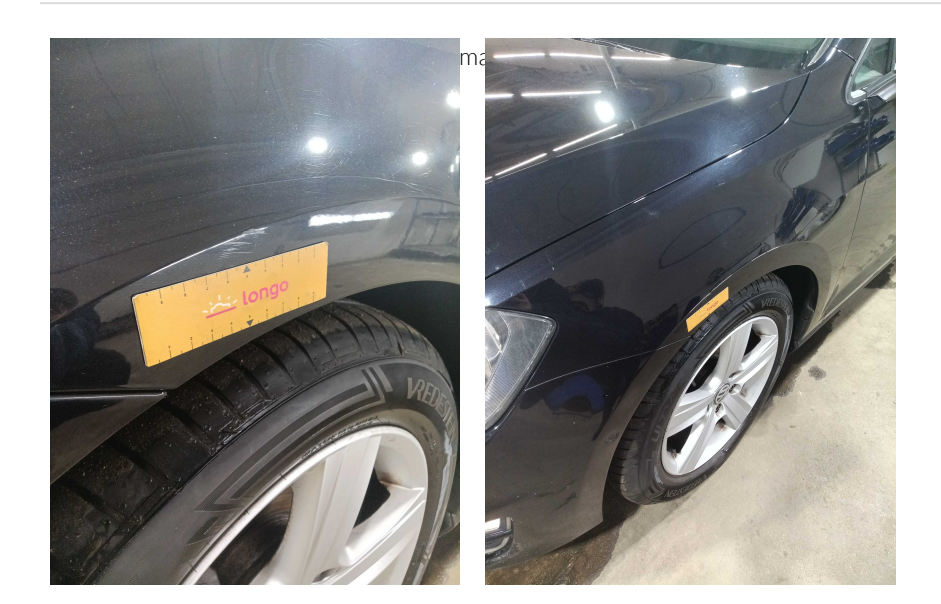
5. SIDE: Left and right side - visual damage / scratches